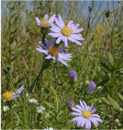
Smooth Aster Flowers