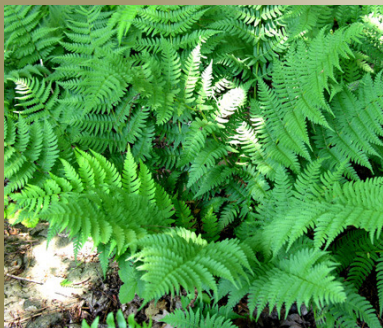
Marginal Woodfern Foliage

Marginal Woodfern ( Dryopteris marginalis ): This fern (up to 2' tall) has dark green, leathery fronds that also add interest during the winter months.