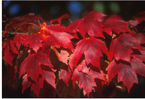
Autumn Red Maple Leaves

Oaks: Several species of oak are native to Long Island including Red Oak ( Quercus rubra ), White Oak ( Quercus alba ), Chestnut Oak ( Quercus prinus ), and Black Oak ( Quercus velutina ). These large trees (50-80') thrive in Long Island's sandy soils and attract both birds and wildlife. Some oaks have pleasant red- or rust-colored foliage in autumn.