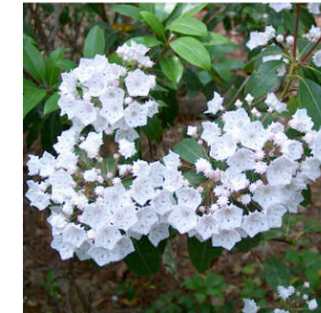
Mountain Laurel Blossoms

Mountain Laurel ( Kalmia latifolia ): This native shrub (5-15') is characteristic of undisturbed woodlands, particularly slopes, on the hilly north shore of Long Island. Mountain laurel has stunning white to pink blossoms in May-June and the evergreen leaves provide winter color.