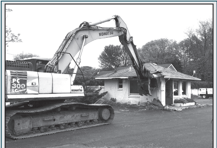
We were pleased to join TRITEC on May 17 th to demolish the blighted, old Motel at West Broadway across from the Harbor. TRITEC will have a ground breaking ceremony and celebration in mid-June when construction on the project will commence.

As a reminder, if you witness a crime in progress your first call should always be to 911. As good as they are, our Code Enforcement Officers are not police. They can and do help SCPD in many ways, but your first call should always be 911.